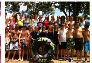
Check out this good looking group at Quest Ranch