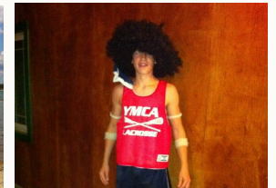
Dude where did you get your hair?