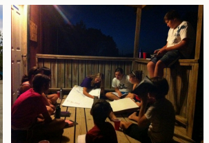
Evening bible study and small groups outside at camp.