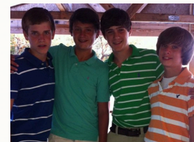
Dress up night at camp.

This mission trip is for the seasoned and new-comer to mission work. Each day you will experience a different type of mission activity. You will work construction, rebuilding homes from the fires, day camp for children, painting and more. You will get a flavor of different kinds of mission ministry and have an opportunity to connect with one or more of them. This will be a week of discovering your gifts and your passions!