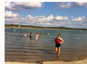
Swimming at Quest Ranch is always fun and refreshing!